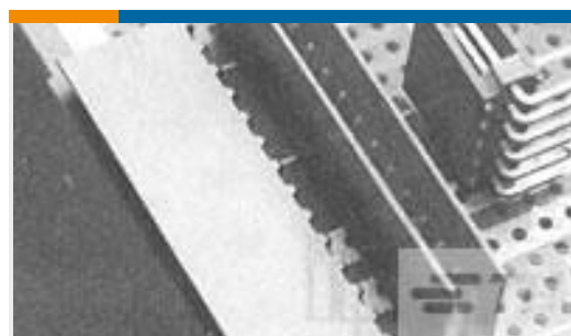
TE Part # 281699-4 HEADER HE13 RA 4 P

Also in the Series | AMPMODU HE 13/HE 14